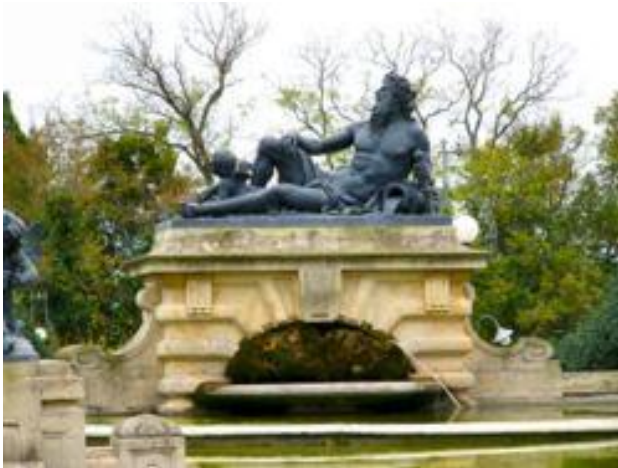
The statue of Neptune

Modelled after the French Château de Saint-Cloud , Euxinograd is often considered to be one of the finest examples of post- Liberation architecture in Bulgaria. After the French chateau was destroyed in 1870, Ferdinand bought the pediment of its right-hand wing for the Euxinograd palace in 1890–1891. The palace was designed after the French 18th-century château style, with a high metal-edged French roof, figured brickwork and a clock tower .